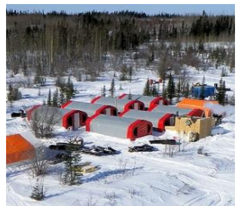
Winter Camp James Bay Lowlands

Issued and Outstanding shares: 123,400,246