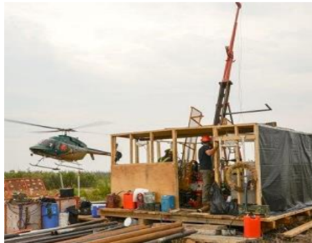
Diamond Drill Setup

Phone: (416) 864-1456 Fax: (416) 865-6636 info@boldventuresinc.com